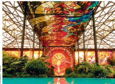
HEIMS / AVL

Day 5 and 6: Valle de Bravo/Toluca/Mexico City We will begin the day with a scenic hike along a waterfall, before driving to the charming colonial resort town of Valle de Bravo. Enjoy lunch overlooking a tranquil lake and a stroll through the town center’s lively markets. In the afternoon, we will begin our return journey to Mexico City, stopping at the ancient city of Toluca to visit Cosmovital Botanical Garden, where 500 plant species glow in the colorful light streaming through 71 elaborate stained-glass panels. Say farewell over a Mexican feast, before returning to the capital this evening for a late check-in to our hotel.