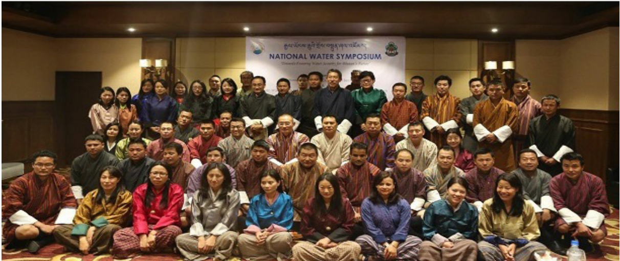
Symposium Participants with the Honourable Chief Guest His Excellency Lyonchhen Dashi Tshering Tobgay