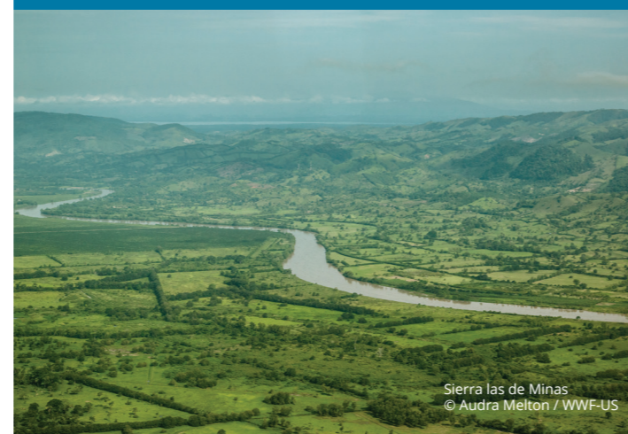
Sierra las de Minas

Equipped with proof points and lessons learned from our on-the-ground projects, we then convene influential partners across regions and countries to advocate for sustainable use of water.