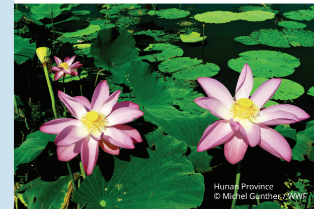
Hunan Province

conducted community surveys and provided alternative livelihood trainings, resulting in the government agreeing to support re-training fishermen as lake patrolmen. The government also agreed to change water level management in the region's Nanji National Nature Reserve , which will increase habitat for the Yangtze finless porpoise and water birds.