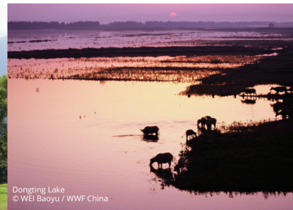
Dongting Lake

The Piedras River in San Pedro Sula