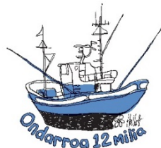
Ondarroa 12 Milia