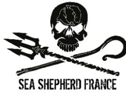
Sea Shepherd France