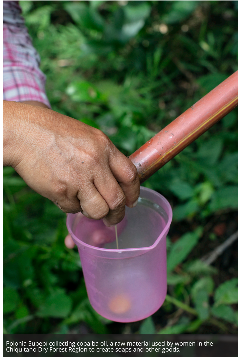
Polonia Supepí collecting copaiba oil, a raw material used by women in the Chiquitano Dry Forest Region to create soaps and other goods.