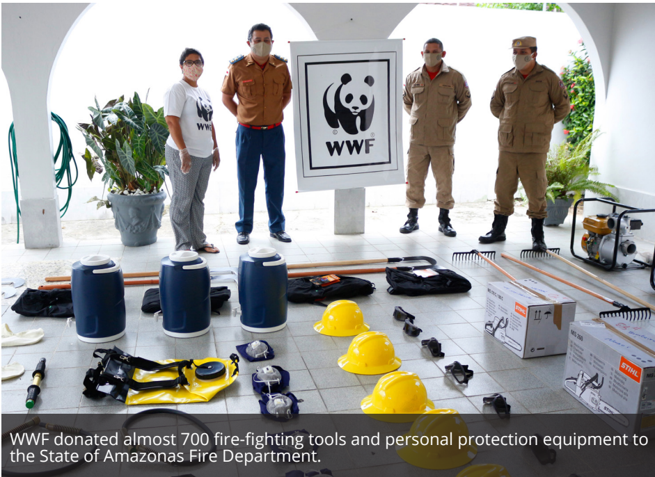
WWF donated almost 700 fire-fighting tools and personal protection equipment to the State of Amazonas Fire Department.