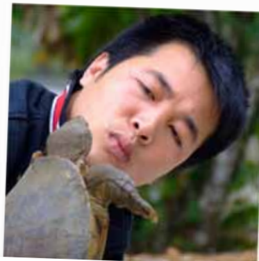
Cong, participant in ATP training, learns about turtle identification

To learn more about the Russell E. Train Education for Nature Program , please contact: