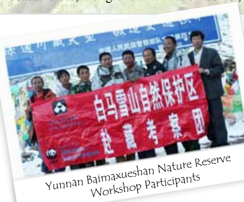
Yunnan Baimaxueshan Nature Reserve Workshop Participants