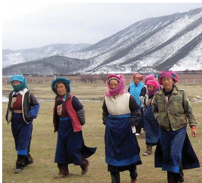
Participants of the Napahai Nature Reserve Workshop on bird conservation returning from field work

Center for Community Development Studies, China —Workshop on the collective forest tenure reform in the upper Mekong in Yunnan Province