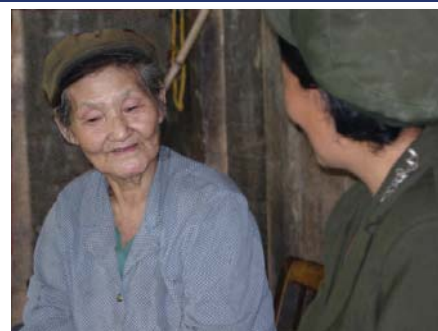
Participant in Center for Biodiversity and Indigenous Knowledge Training in China

Center for Biodiversity and Indigenous Knowledge, China —Second phase of the multi-stakeholder dialogue on the future of Swidden Agriculture in Dulongjiang in Gonsan County