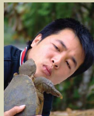
Participant in the turtle conservation training workshop in Vietnam

WWF Greater Mekong Program, Vietnam —Training workshops on strengthening capacity in protected areas for effective management