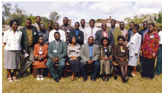
Participants in the Environmental Impact Assessment in Malawi

Panchawati Rural Development Center, Nepal —Elephant Conservation Awareness Workshop in Sunsari, Koshi