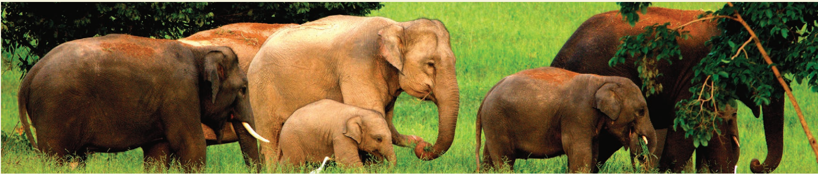
A herd of Asian elephants. Opposite: A farmer and his dog stand guard against wild animals that might raid his crops at night.

As nearby countries have depleted their own natural resources, their sights have turned toward Bhutan's attractive natural riches. This has brought some serious new problems to the country.