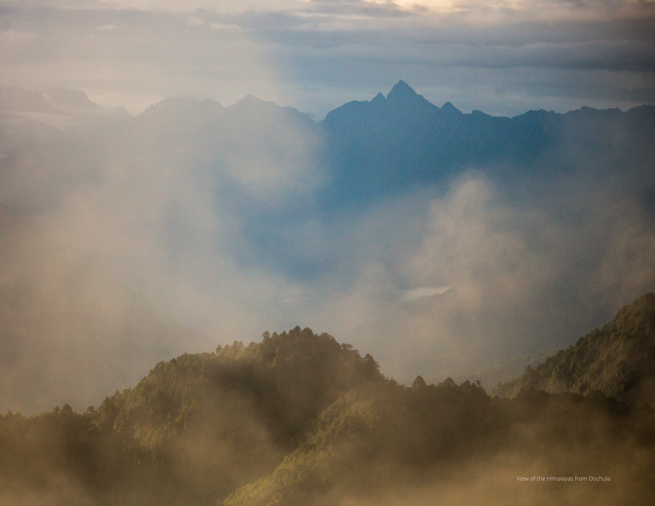
View of the Himalayas from Dochula