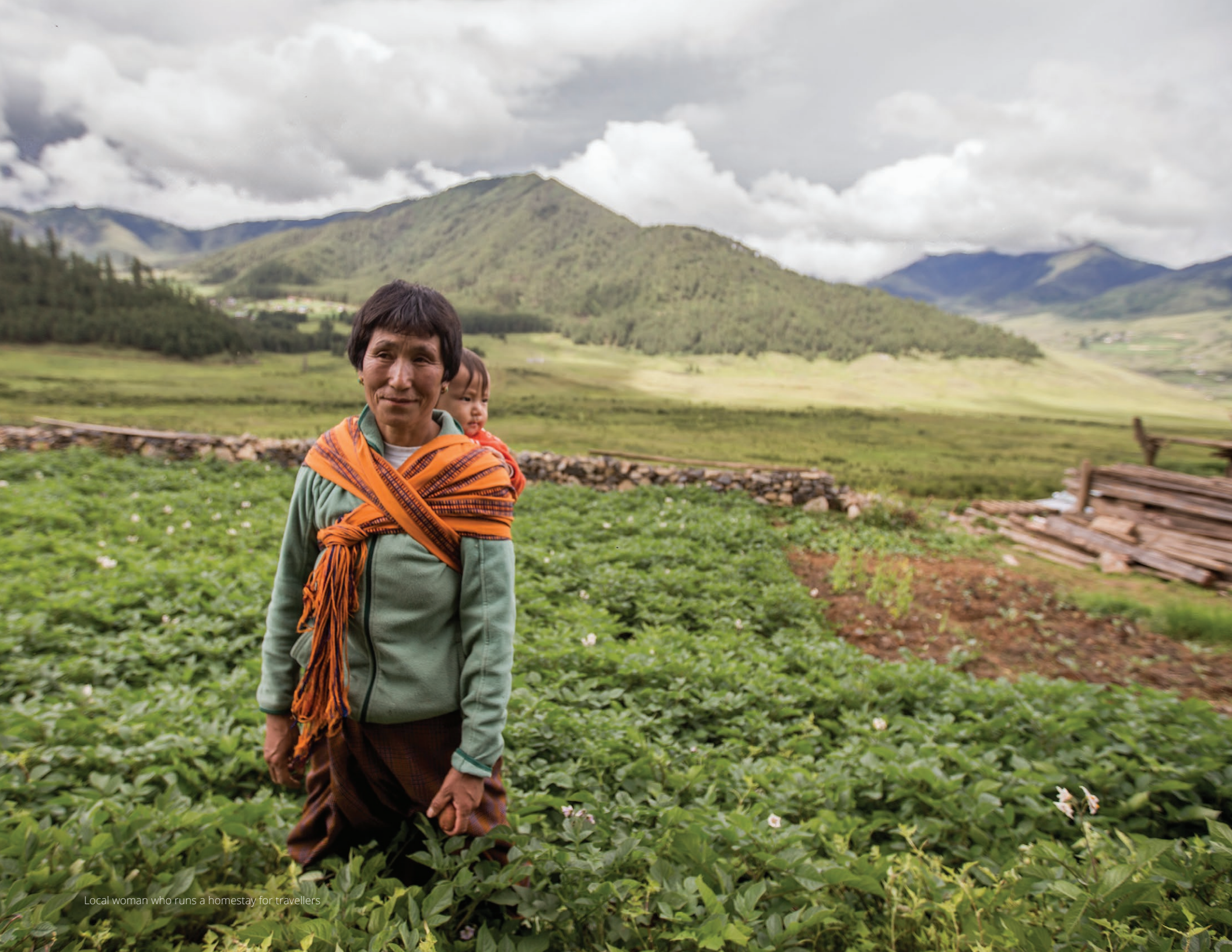
Local woman who runs a homestay for travellers