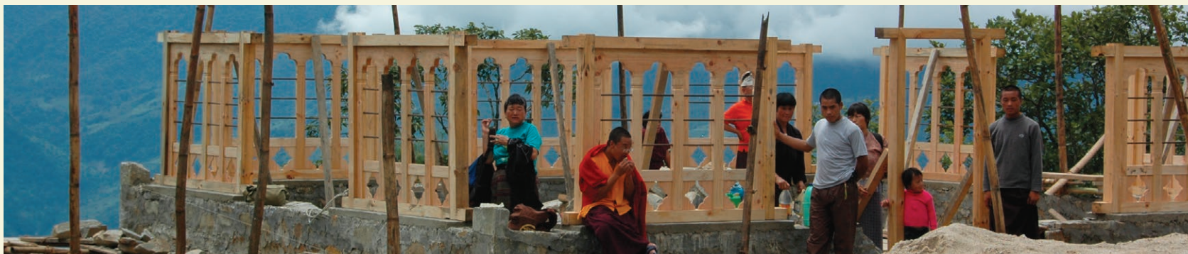
Men build a traditional home. Opposite: Forest canopy of ferns and other epiphytes

Bhutan is part of the Eastern Himalayas region—an area where the impacts of climate change are often more severe than anywhere else in the world. The region's glaciers have been melting at alarming rates, and it is suffering increasingly intense rainstorms, which bring damaging floods and landslides in their wake.