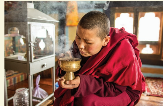
L to R: A local hotel manager books reservations; a tributary of the Thimpu River; a Bhutanese nun makes an incense offering. Opposite: Centenary Farmers Market in Thimpu

The nation's natural richness doesn't just help wild species. It helps people, too.