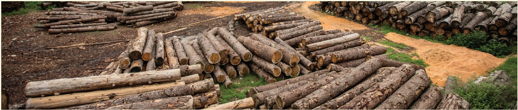
Opposite: Electricity switching station. Above: Logging is on the rise.

The Bhutanese government wants to address all these new threats and protect the conservation investment it has built up. It has goals to increase enforcement, provide training programs for rangers and local people, and develop job opportunities for people in rural areas. Of course, all this requires funding beyond what has previously been allotted for conservation.