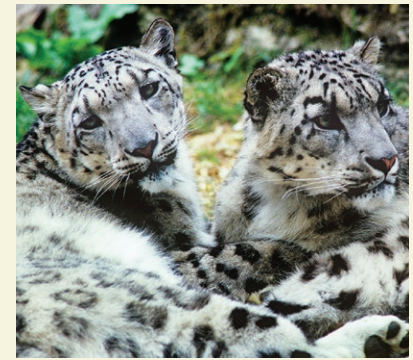
Opposite: Black-necked cranes. Above, L to R: Bengal tiger; blood pheasants; takin; snow leopards

This abundance of pristine protected areas is a haven for wildlife.