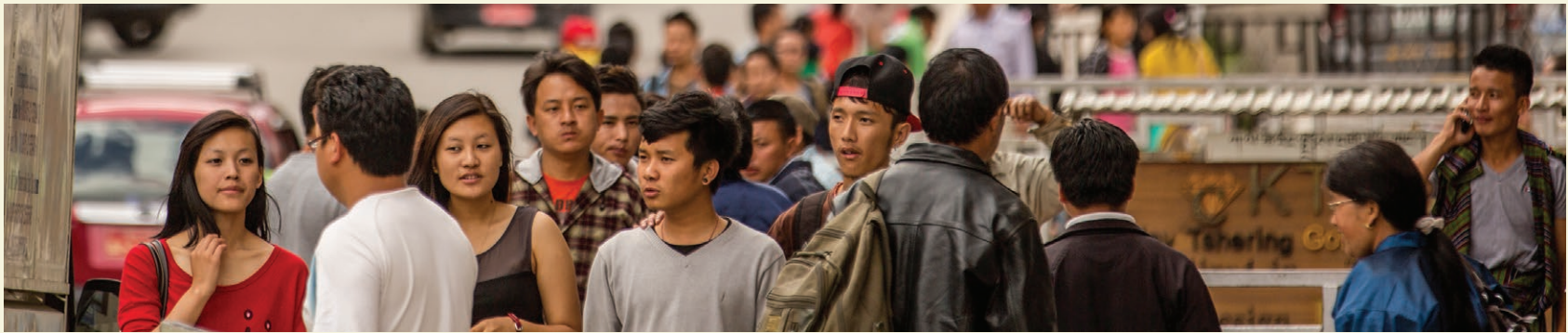
Opposite: A young farmer sells fresh produce roadside. Above: For many Bhutanese youth, traditional dress has given way to Western fashions.

After decades of sustaining this treasure for Bhutan and the world, times are changing and new pressures are rising up.