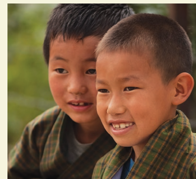
Opposite: View over the Himalayas from the Royal Botanical Gardens. Above, L to R: Senior monks gather at a monastery; traditional painting; incense at a farmers market; schoolboys in traditional dress

For decades, the government of Bhutan has stayed true to its commitments. It has worked closely with WWF to build this treasure so that both conservation and economic development can occur in a balanced, sustainable way.