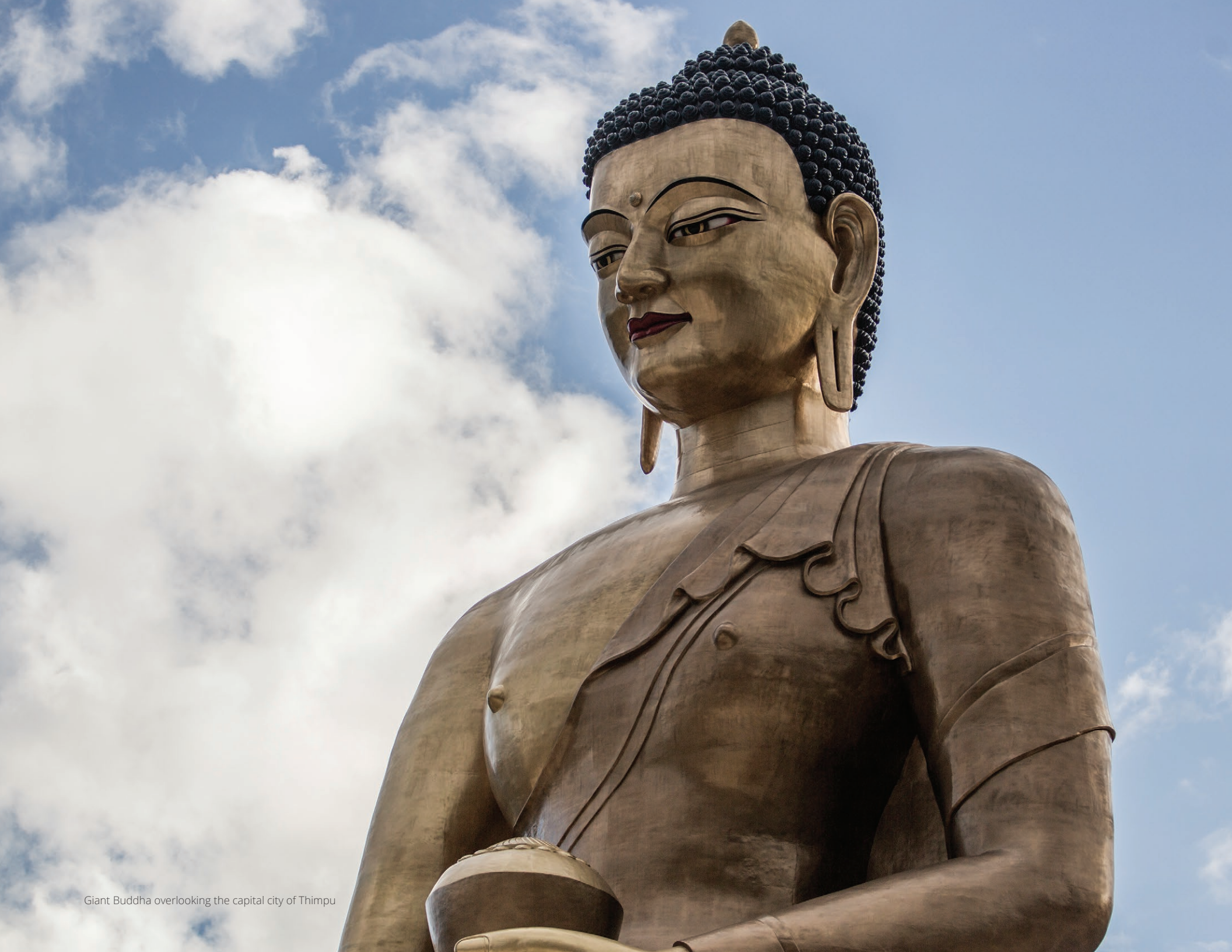
Giant Buddha overlooking the capital city of Thimpu