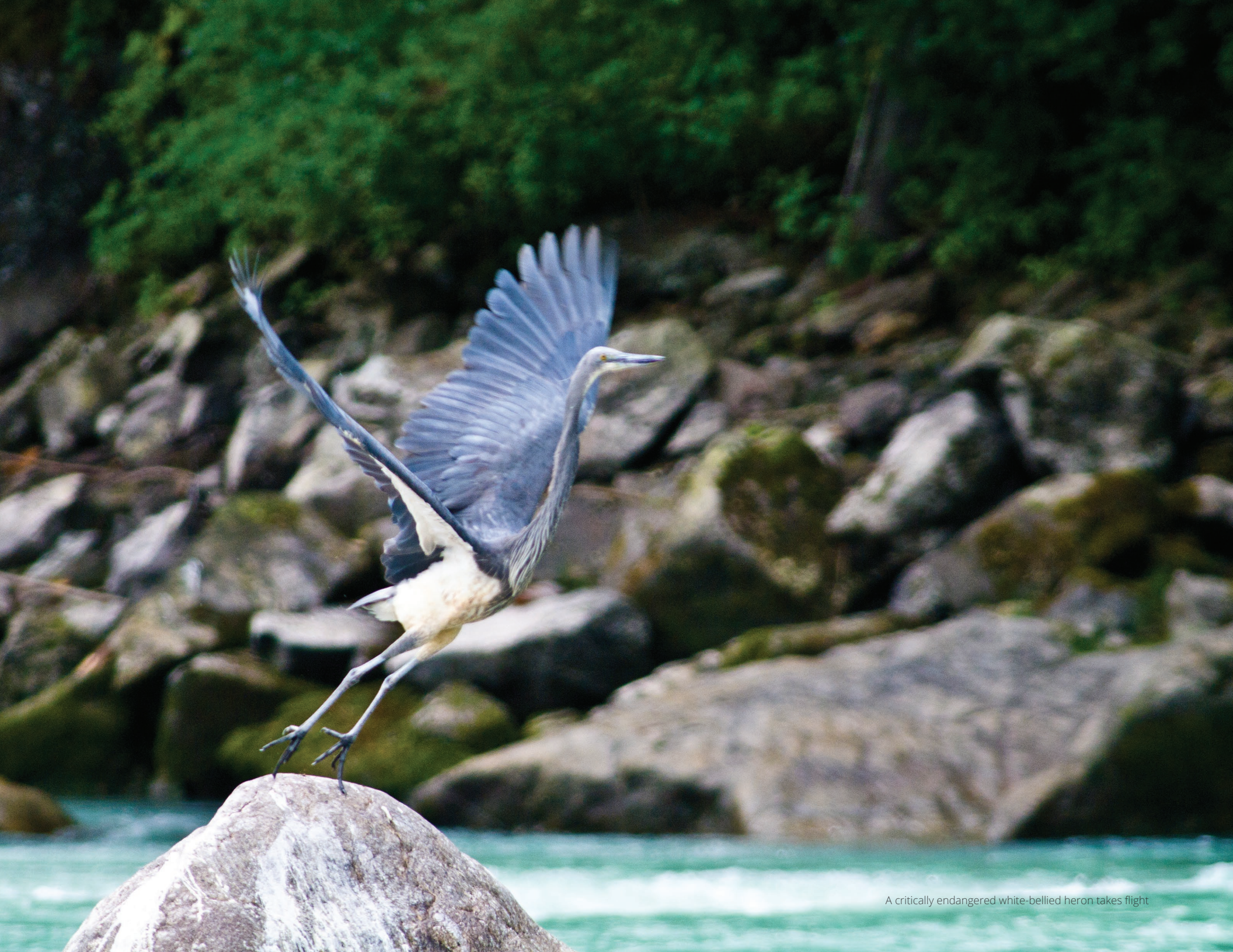
A critically endangered white-bellied heron takes flight