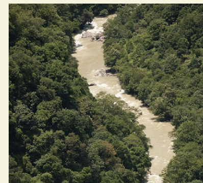
L to R: Red panda; prayer flags over Paro Valley; painter working on a homestay; river curving through forests in rural Bhutan. Opposite: Monk in Punakha Dzong

Your support of the Bhutan for Life project is more than just a financial contribution. It's a legacy for a lifetime—and beyond.