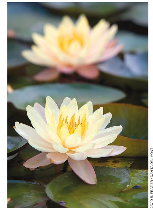
DAVID P. FRAZIER / DANITA DELMONT

This morning we will visit Tram Chim National Park, one of the most important remaining expanses of wetlands in Vietnam,