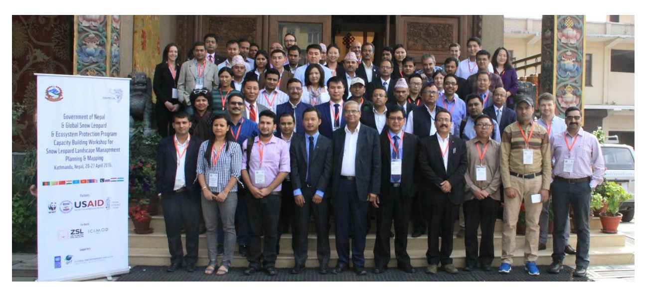
Group photo of all workshop participants.

Participants will meet again at the "Landscape Management Planning Stocktaking Dialogue," to assess progress in the landscape plan development process, including mapping, and discuss regional issues like illegal wildlife trade.