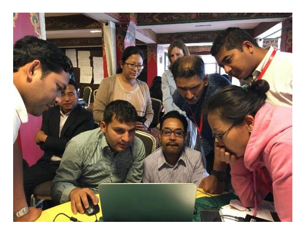
Participants from Nepal discuss the borders of the eastern Nepal GSLEP landscape.

Day 1 began with a review of existing mapping efforts across the snow leopard range, with each country group presenting its current mapping analysis for each of its landscapes in brief, 5-10 presentations to establish a baseline of information. This helped the facilitators, GIS experts in snow leopard distribution and water and climate issues, to better understand exactly what information already exists and could be used for additional mapping planned for the USAID-funded WWF Asia High Mountains Project in support of the landscape planning process.